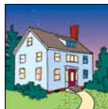
. . . or home

But don't just send one rep. We have reduced the group discount rate for hospitals and health systems in the first Early Bird period. Send your RAC liaison, your PA, and a nurse/case manager (or any combination or 3 or more) before September 20 for $595 each. Estimate the cost of registration, travel, and a hotel group rate of $179 against the cost of one denied inpatient claim. (See the word "ROI" above.) Join us in December. This might be your best hospital investment in 2013.