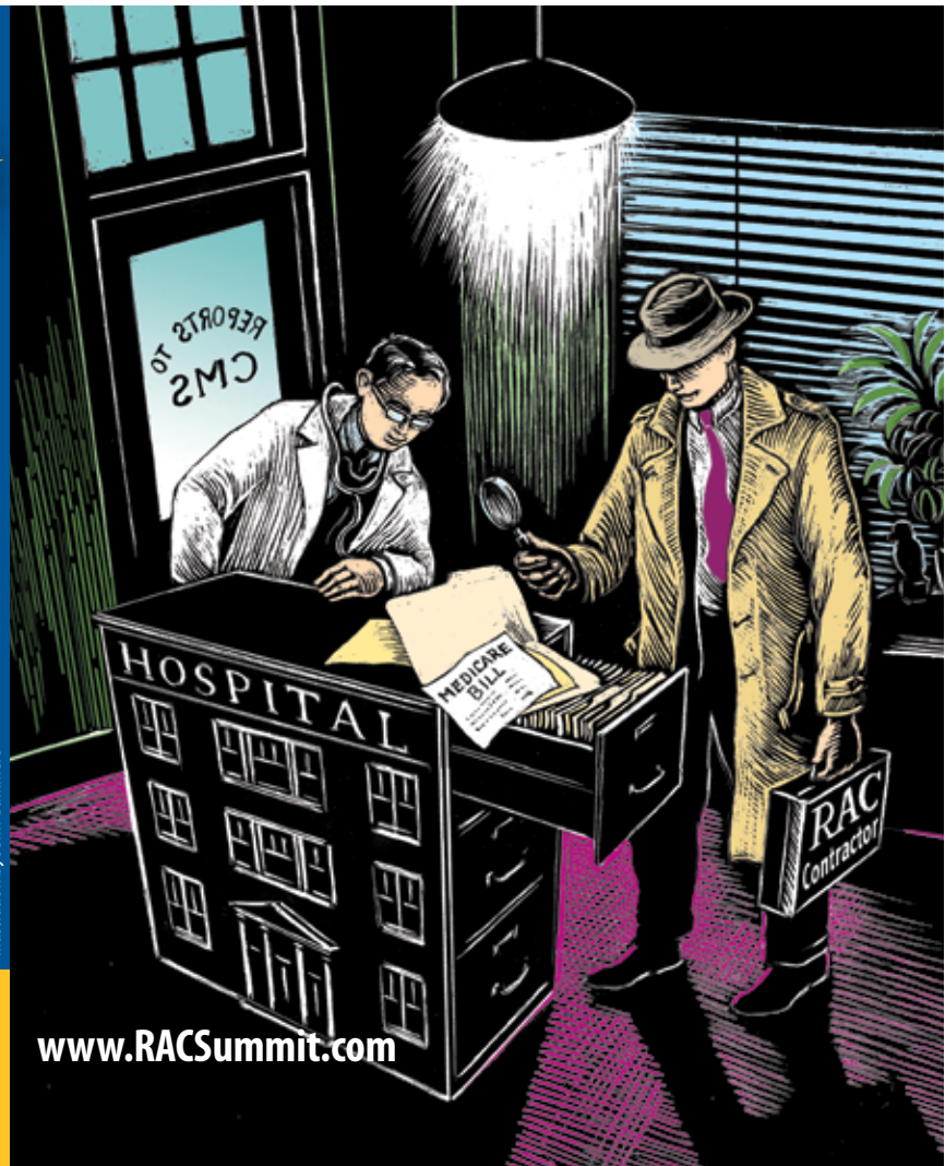
Illustration by John Gummere

Co-located with the Fourth National Readmissions Summit and the Seventh National Predictive Modeling Summit