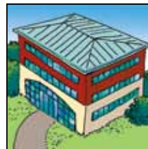
At your office . . .

PROS: Live digital feed and 24/7 Internet access for the next six months; accessible in the office, at home or anywhere worldwide with Internet access; avoid travel expense and hassle; no time away from the office.